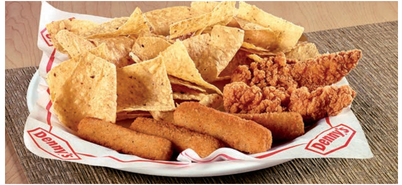
BUILD YOUR OWN SAMPLER™ PICK FOUR 16.99 PICK THREE 13.99 Served with choice of dipping sauces. Premium Chicken Tenders Bacon Cheddar Tots Onion Rings Chips & Queso Mozzarella Cheese Sticks Wavy-Cut Fries Seasoned Fries