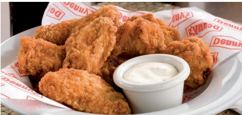
CHICKEN WINGS Lightly seasoned breaded chicken wings golden-fried and crispy. With your choice of dipping sauce. 13.29