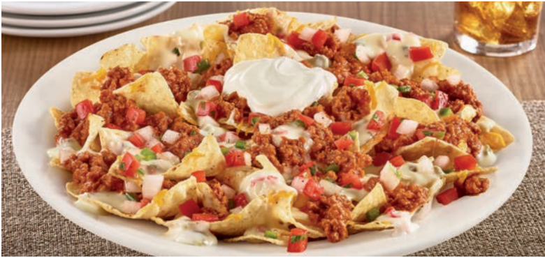
ZESTY NACHOS GF Tortilla chips freshly cooked and topped with Pepper Jack queso, Cheddar cheese, seasoned nacho meat, fresh pico de gallo and sour cream. 13.99