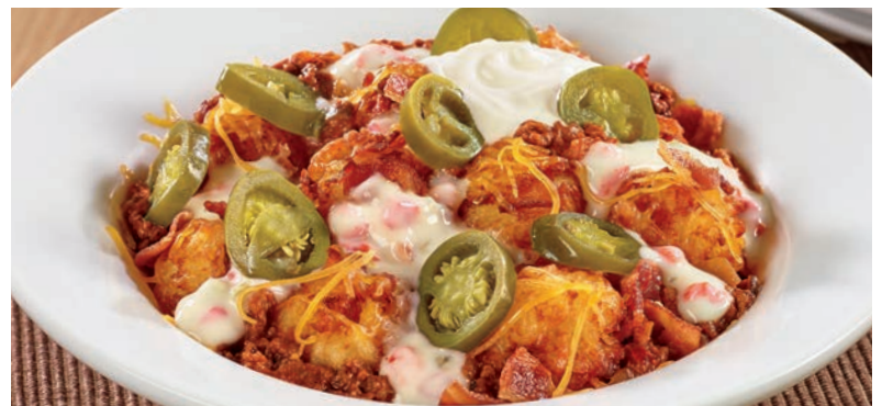
LOADED NACHO TOTS House-made Bacon Cheddar Tots topped with Cheddar cheese, Pepper Jack queso, seasoned nacho meat, bacon, jalapeños and sour cream. 11.99 TEN BACON CHEDDAR TOTS 6.99