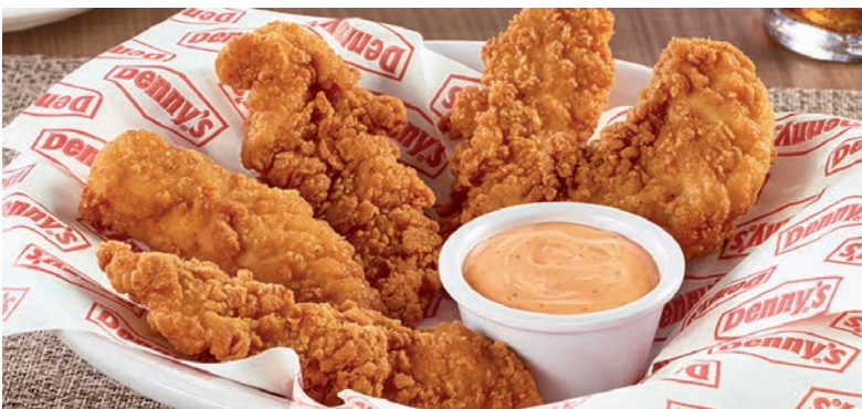
PREMIUM CHICKEN TENDERS Premium golden-fried chicken tenders with choice of dipping sauce. 13.29 MAKE IT A FULL MEAL WITH TWO SIDES & DINNER BREAD 15.29