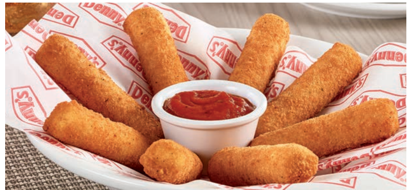
MOZZARELLA CHEESE STICKS Eight golden-fried cheese sticks with a side of tomato sauce. 9.99